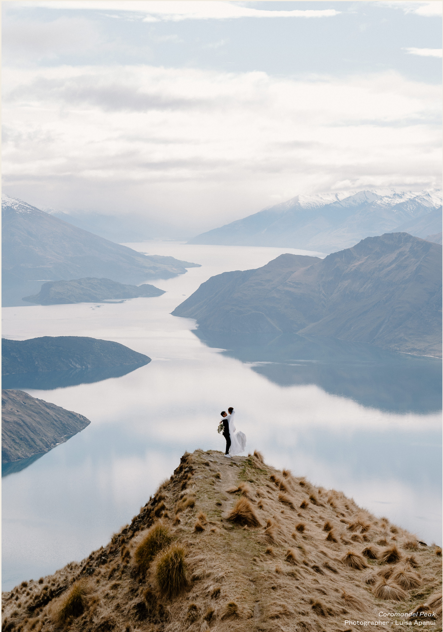
Coromandel Peak