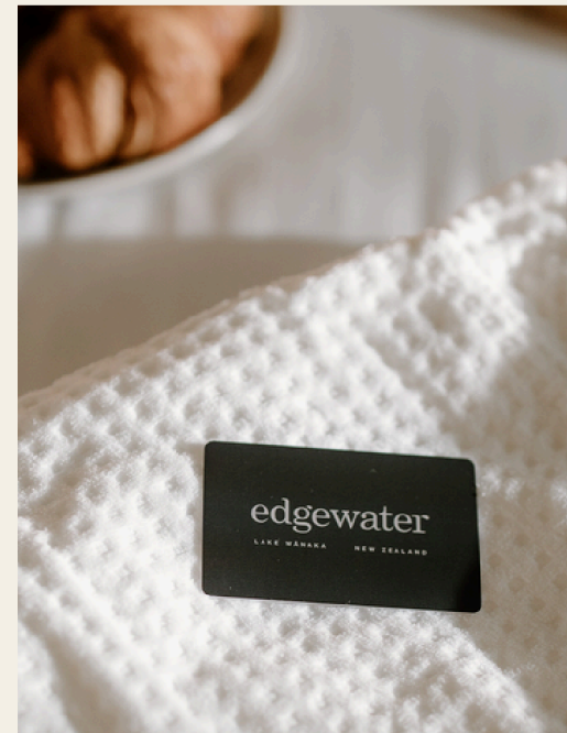
Edgewater Gift Card