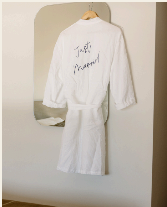
Edgewater linen robes.