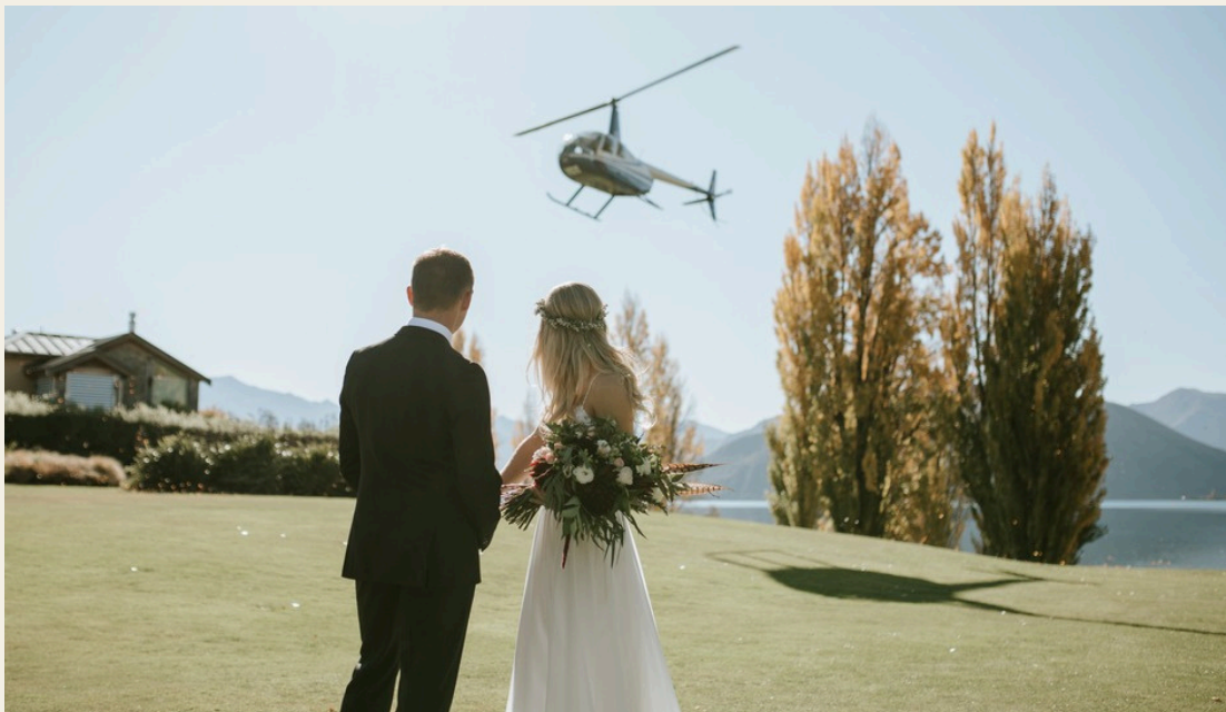
Helicopter landing at our onsite helipad.