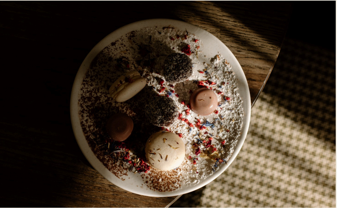
Home Made Sweet Treats

(Presentation subject to change as per chef's choice)