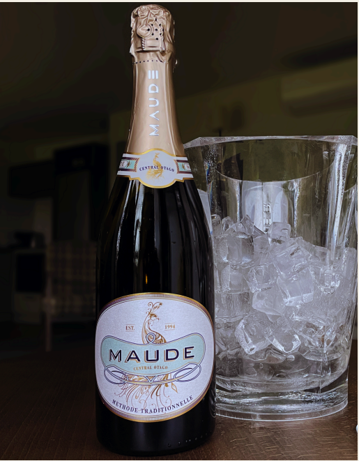
Maude Methode Traditionelle