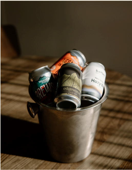
Bucket of beer